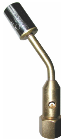
ZS 14/3,5-P Ø14mm/Ø 3,5mm 71651915