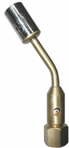
ZS 14/6,0-P Ø17mm/Ø6,0mm 71651916