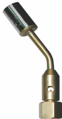
ZS 12/1,4-P Ø12mm/Ø1,4mm 71651914