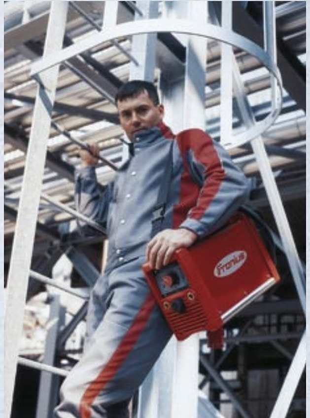
Lightweight and portable, and so right at home on every worksite.

Providing the very highest levels of safety is part-and-parcel of being a serious supplier. For Fronius, this is a minimum requirement to be met by every welding system. Of course, the new TransPocket 2500 and 3500 machines come with all the necessary national and international certificates: S, CE, CSA and CCC marks and many other national marks of conformity. Not to mention “Degree of protection IP 23”.